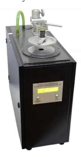
Fig. 2. Air permeability tester MT 160

Air permeability was carried out in accordance with GOST ISO 9237-2013 "Textile materials. Method for determination of air permeability". The tests were carried out using the Air Permeability Tester MT 160 by "Metrotex" (Fig. 2).