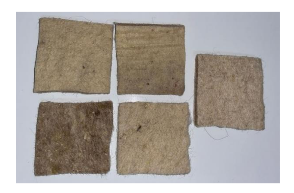
Fig. 1. Samples of nonwoven materials

Materials and methods . Six samples of sheep wool nonwoven fabric obtained by needle-punching were analysed (Fig. 1.). The samples differed in the number of layers, thickness and density. The materials were obtained from 100% coarse and semi-coarse wool of fat-tailed and "Bayys" (Kazakh fat-tailed semi-woolly breed) sheep breeds, provided by IP "Miras".