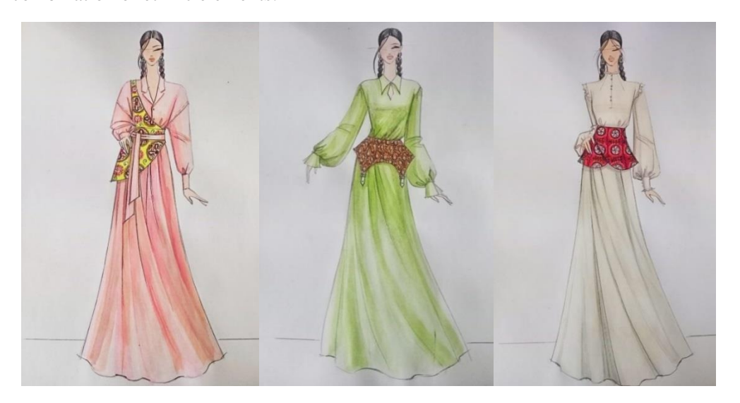
Figure 3. Sketches of women's suits with «basque» ornamented with prints

These fabrics were developed for use as «basque» in women's suits, shown in Figure 3. The color design and texture of the materials, «basque» cutting features as the main decorative element and the ornamented ethnic print are of great importance in the compositional design of the costume. The integrity and scale of the composition, the imagery and color of the costume is achieved through a harmonious combination of ethnic elements.