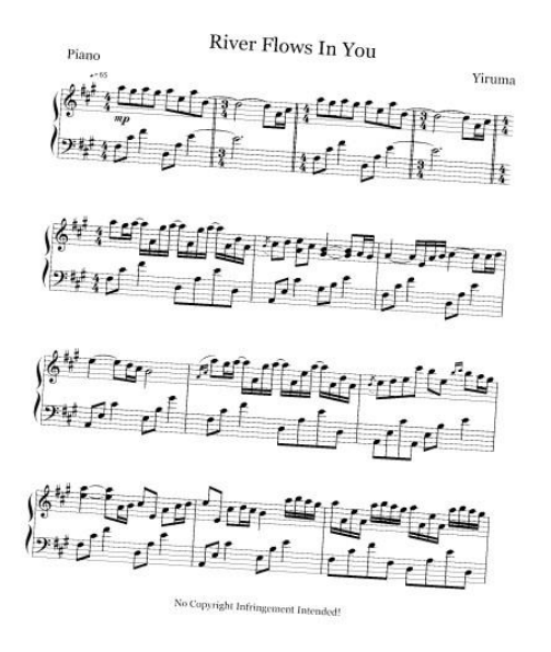
Figure 7. The result of the enhanced image

According to the principle used to calculate the threshold T, the most commonly used binarization methods can be divided into the global threshold method <sup>[3]</sup>, the local threshold method <sup>[4]</sup>, the maximum inter-category variance method <sup>[5]</sup> and the local text information method <sup>[6]</sup>. Due to differences in paper quality and light differences while taking a photo, it is difficult to achieve a good balance between automation, computational complexity, and effects with the global threshold method, local threshold method, and local text information method. Given that there is no complex foreground and background in the image of the score, the foreground mainly consists of notes containing a lot of musical information, while the background often has a transitional smooth color, and they have strong contrast after image enhancement, as shown in the figure. 7. In accordance with the above characteristics of the score image, the maximum intercategory variance method was used to binarize the score image<sup>[6]</sup>. The maximum inter-category variance method is an adaptive thresholding method proposed by the Japanese scientist Otsu in 1979<sup>[5]</sup>, which can automatically calculate the segmentation threshold according to the characteristics of the gray distribution in the image, and separate the image into background and foreground. The algorithm includes the following steps: