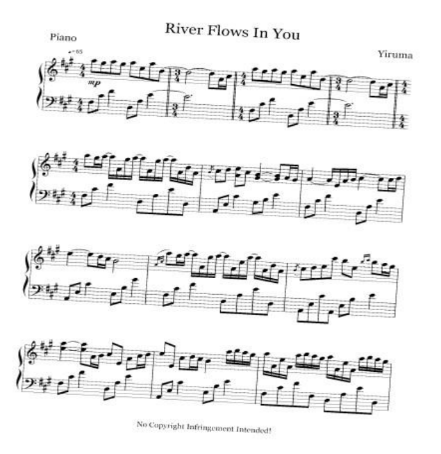
Figure 8. Graph of binarization results

4. Comparing all \sigma , \delta , the maximum threshold value was obtained as the global image threshold, and then using formula 5 to perform the binarization operation, the following result was obtained in Fig. 8.