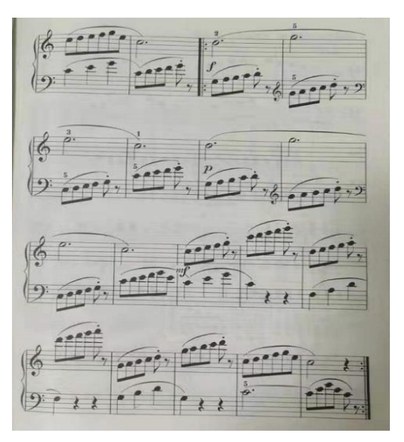
Figure 1. Image with a yellow tint

Introduction. The object of the research is images of musical scores obtained by using mobile terminals such as mobile phones or tablets. Image quality has an important impact on the complexity of algorithm design, as well as on the efficiency and accuracy of recognition. Due to the quality of the paper itself, score images often have the following problems: The color tone is yellowish and noise is present, which is caused by differences in paper quality, poor user data storage, and intrinsic noise of the electronic equipment used for taking photo, as shown in Figure 1.